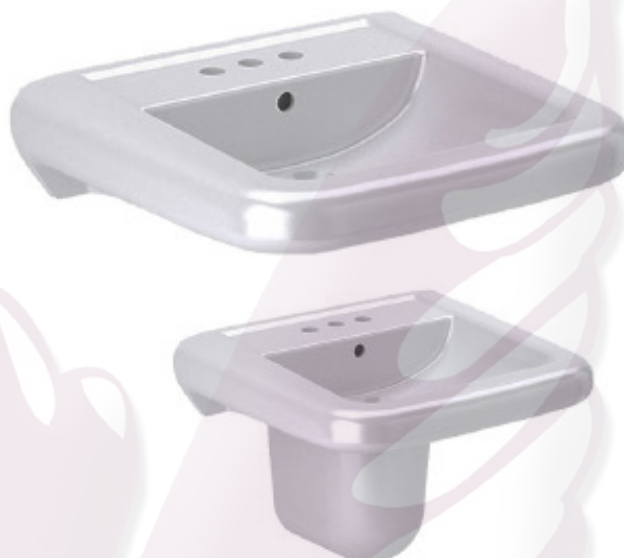
SS-3065 shown with optional SS-27 Shroud