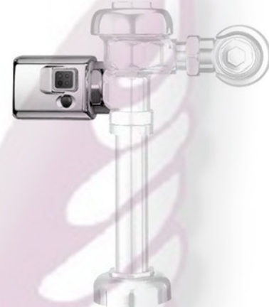
Side Mount Operator units do NOT include a Valve Body, Supply Stop or Vacuum Breaker.