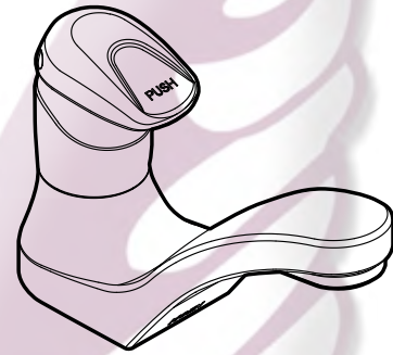
Single-Handle ADA Metering Lavatory Faucet