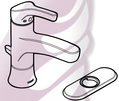
Danika™ Single-Handle Lavatory Faucet Models: 64733 L84733 (includes deck plate)

Note: THIS FAUCET IS DESIGNED TO BE INSTALLED THRU 1 HOLE, 1-1/8" MIN. DIA.