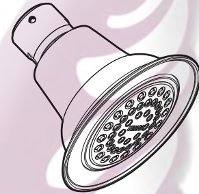
Single Function Showerhead